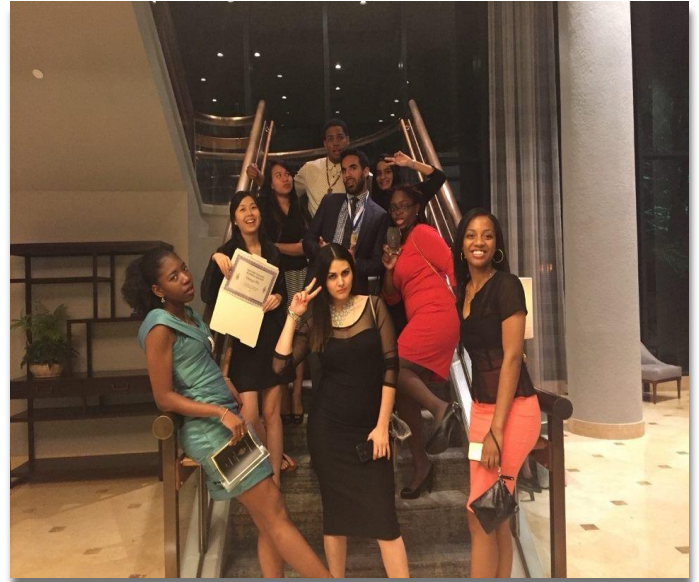
Omega Phi Chapter